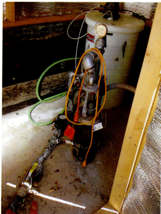
1) Well 1 (55-645071) back-up