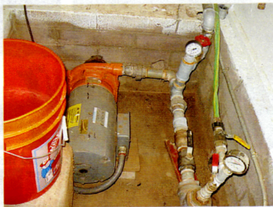
10) Siphon pump.