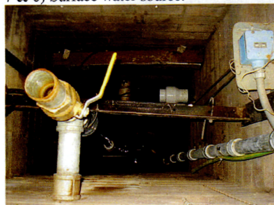
9) Siphon box.