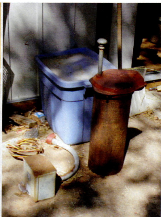
2) Well 1 (55-645069) inactive.