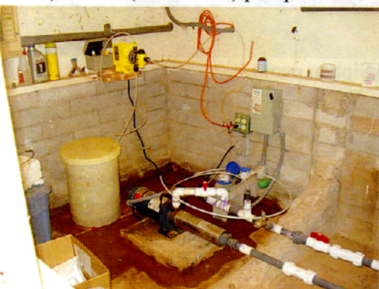
5 & 6) Interior pump house well 3.